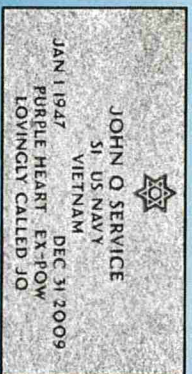
Flat Granite or Marble