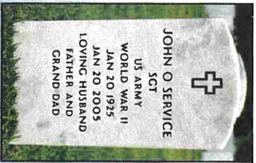
Upright Granite or Marble