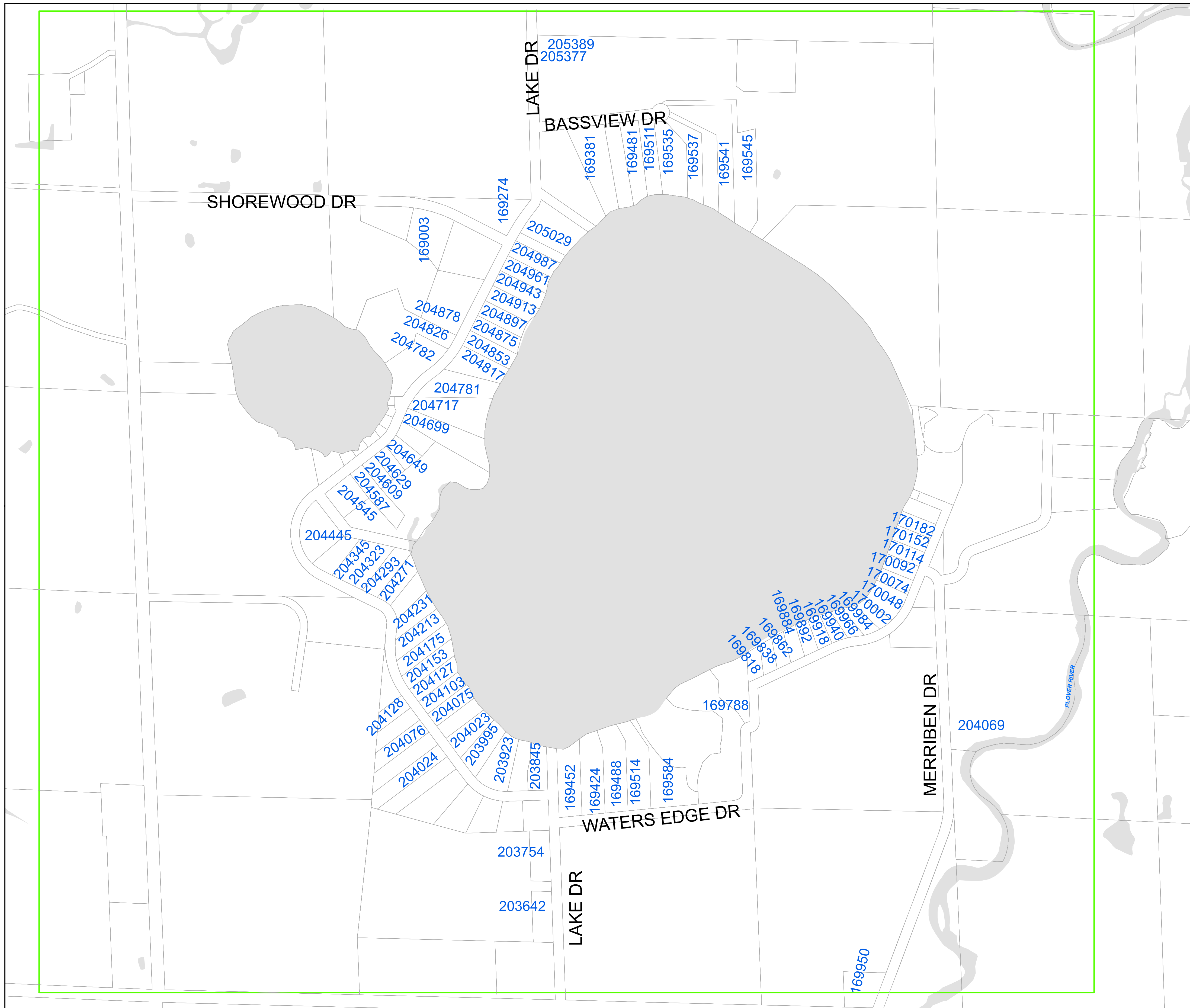
BIG BASS LAKE