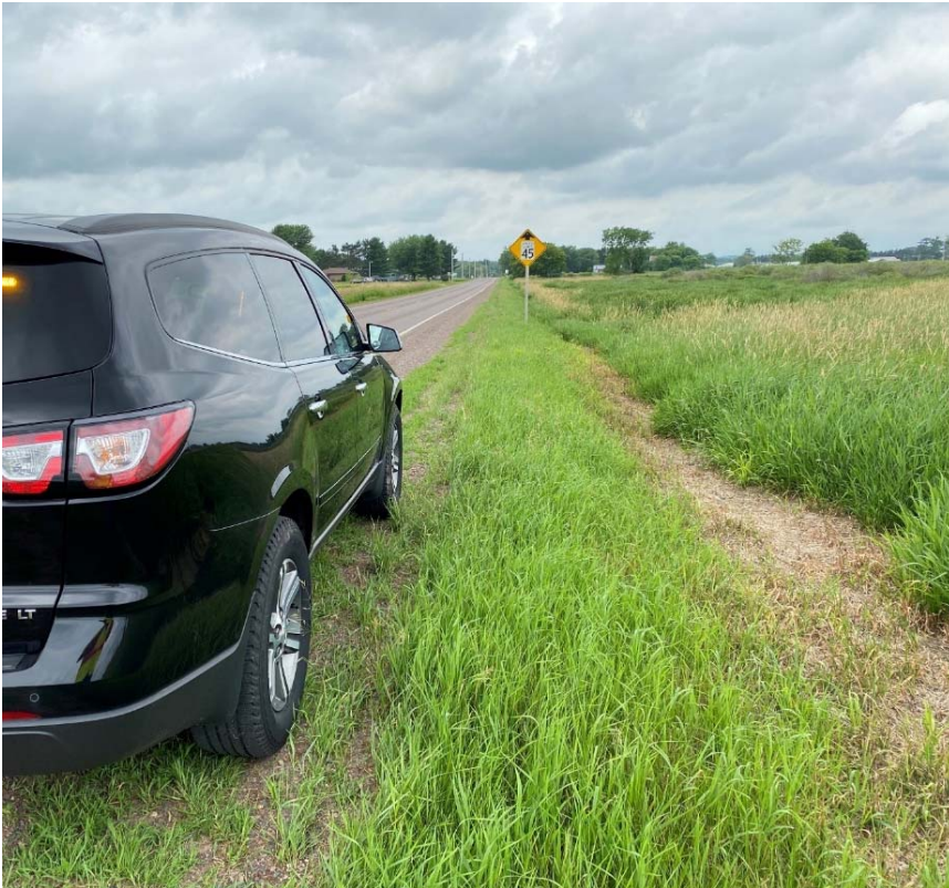
Treated north slopes