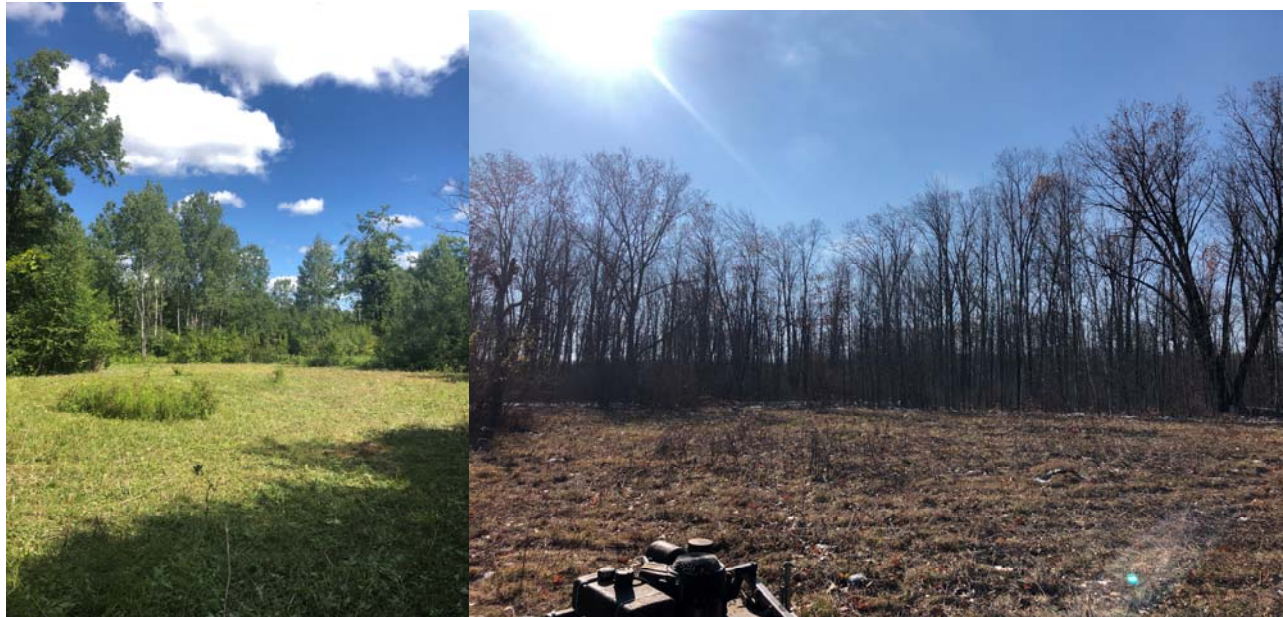
Openings mowed in Ringle in 2020

Maintaining early successional habitat, such as grass openings, is an important part of Central Wisconsin forest management. In 2020, 13 forest openings were mowed in the Harrison-Hewitt, Ringle and Leather Camp units. Twenty-seven openings were scheduled to be managed in 2020. The openings not managed will be added to future work plans.